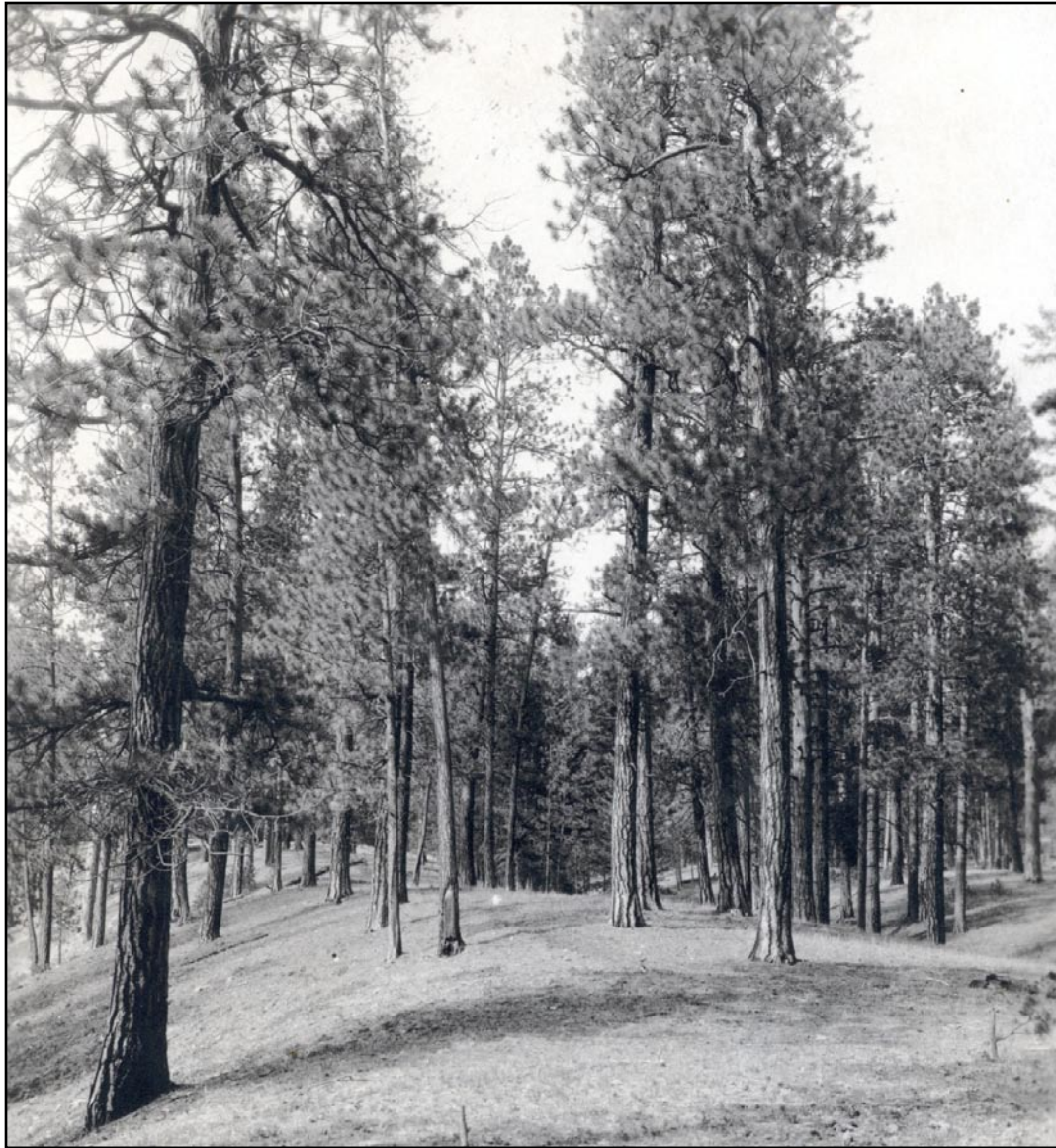
Figure 1 —Ponderosa pine stand on the Okanogan-Wenatchee National Forest in the early 1900s. The parklike structure consists of widely spaced trees in the canopy layer, few shrubs in the middle forest layer, and grasses and forbs in the lower forest layer.

had large gaps among the groves of ponderosa pine maintained by periodic fire (Harrod and others 1999; Everett and others 1996). Although mature pines resisted fire, small pines often were killed by fire. Well-maintained pine stands had few saplings (Everett and others 2000). Little information is available on the structure of the middle layer, ~2 to 4 m high. It may have been a fragmentary mix of shrubs, most likely bitterbrush ( Purshia tridentata ), spirea ( Spiraea spp.), and mountain balm ( Ceanothus velutinus ) (Franklin and Dyrness 1988; Weaver 1951). The mostly continuous lower layer, ~1 to 2 m high, was formed by grasses, forbs, and low-growing shrubs. Pinegrass ( Calamagrostis rubescens ), elk sedge ( Carex geyeri ), Idaho fescue ( Festuca idahoensis ), lupines ( Lupinus spp.), hawkweeds ( Hieracium spp.), and roses ( Rosa spp.) were common members of the lower layer (Franklin and Dyrness 1988; Weaver 1951).